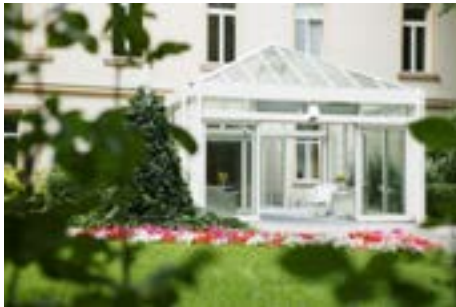
Confraternität- Privat Clinic Josefstadt, Vienna 96 beds Prevention Clinic www.pkj.at