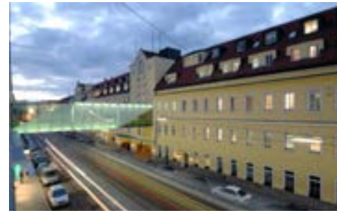
Private Clinic Döbling, Vienna 159 beds with connected Outpatient Clinic www.pkd.at