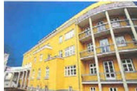
Privat Clinic Wehrle, Salzburg