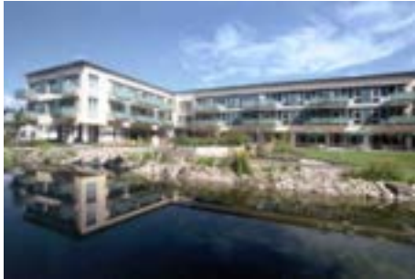
Privat Clinic Graz Ragnitz, Stmk.