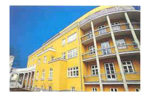
Privat Clinic Wehrle, Salzburg 78 beds <u>www.pkw.at</u>

Privat Clinic Graz Ragnitz, Stmk. 144 beds <u>www.pkg.at</u>